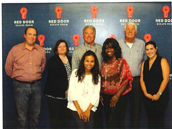
Parker Law Firm staff members collaborate so they can “escape” during a recent team-building excursion at Red Door Escape Room in Southlake.

With 60 minutes to escape the room, staff members had to collaborate if they were going to be successful just as they do when approaching a case. This is just one of many activities in which the firm participates to maintain a strong team.